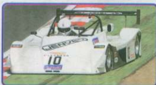
Pushing a little too hard and on to the grass